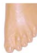
Color Guide 01 - 18